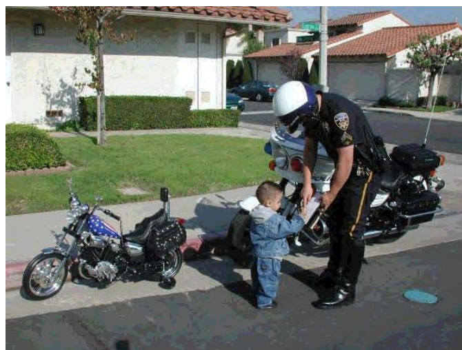
Yes, but Officer my mom’s in CPAANT!